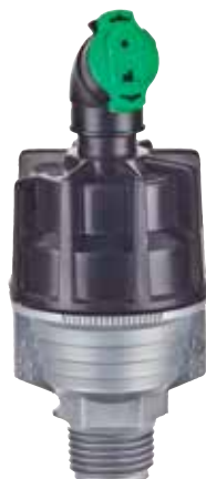
Regulated (silver base)

Applications: field crops, greenhouses, residential and landscaping For extra-range spacing up to 12 m