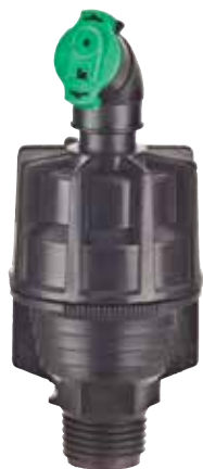
Non regulated (black base)